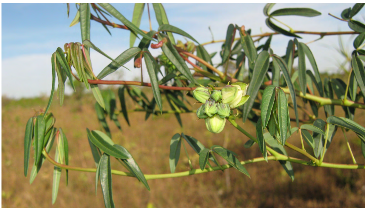
Manihot gracilis Pohl, a secondary genetic wild relative of cassava ( M. esculenta subsp. esculenta ), in Brazil