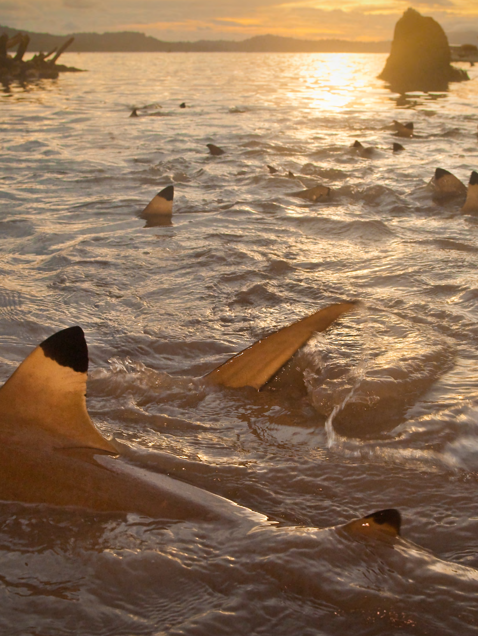
Black-tipped reef sharks ( Carcharhinus melanopterus )