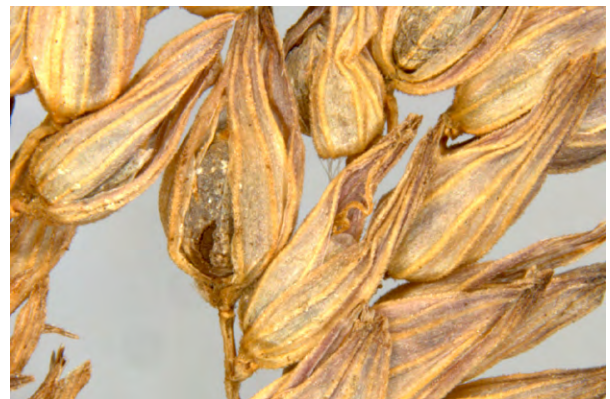
Ustilago suddiana