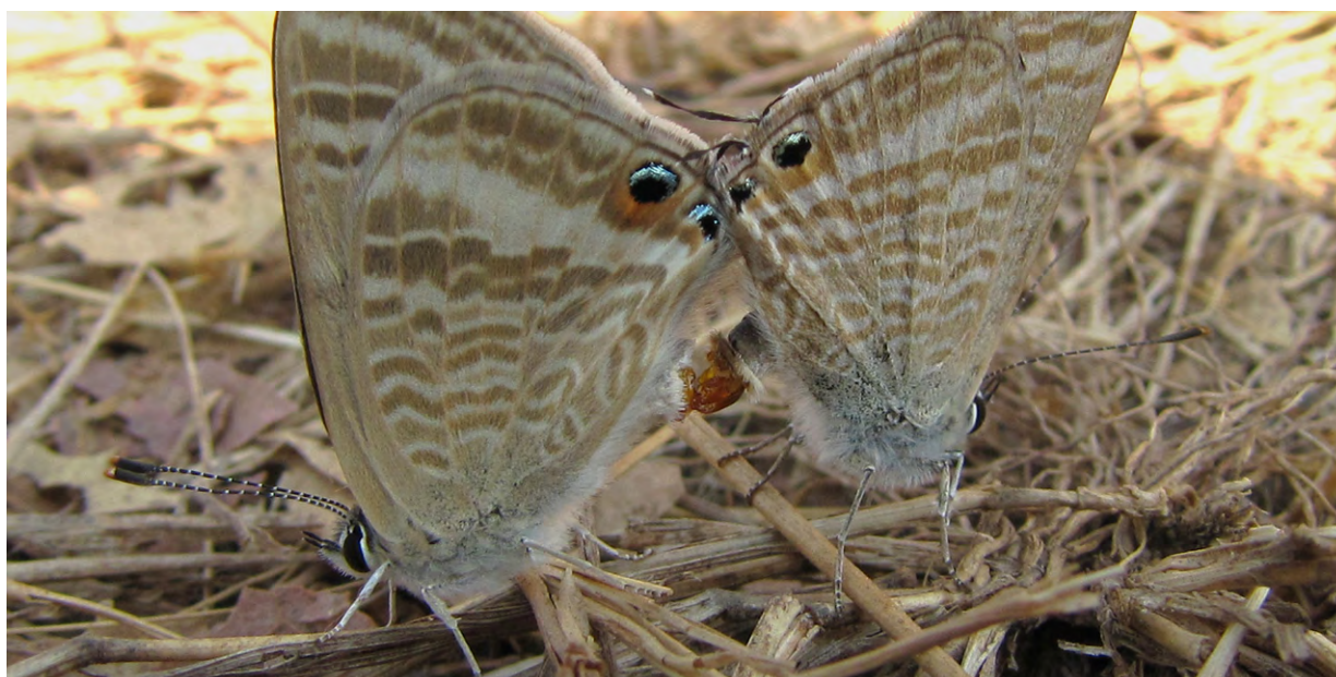
Mating of Pea Blue ( Lampides boeticus )