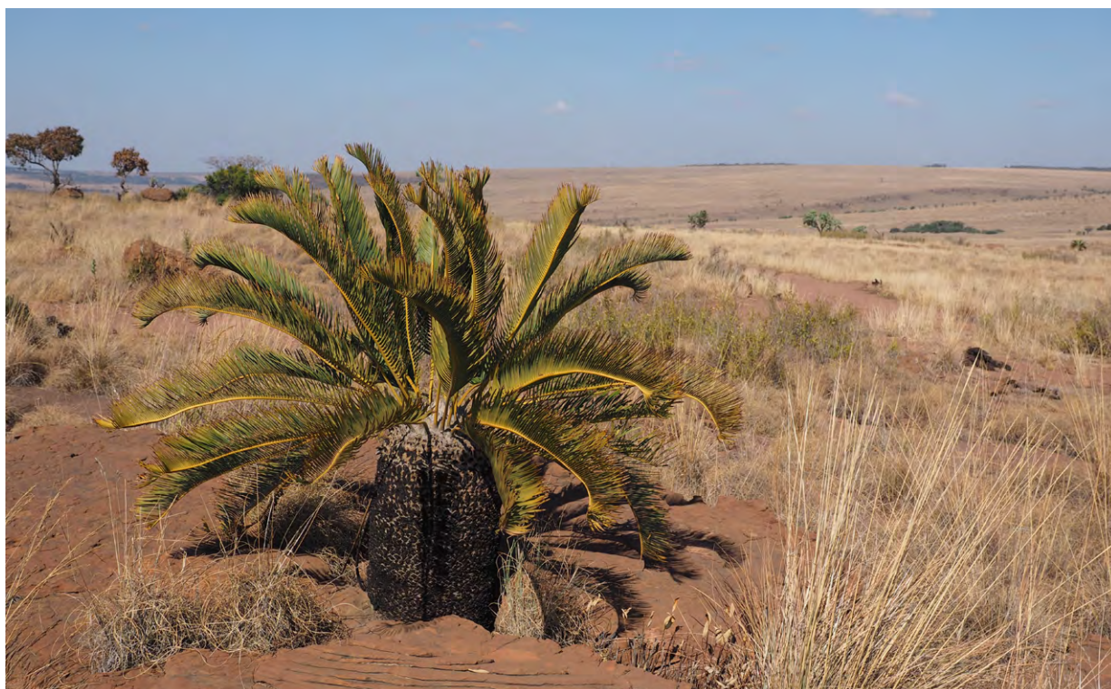
Woolly cycad ( Encephalartos lanatus )

Many restricted range species may be assessed based on a single spatial unit, or two spatial units (e.g. one for the extant range and one for the extirpated range). This may also be the case for a species that has always existed in a very specific type of ecosystem or a species whose function is similar in the different ecological settings it exists in. For other species, three or more spatial units may be necessary to represent the variety of ecological conditions and contexts that the species occurs or has occurred in.