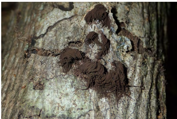
Stemonaria longa in Guadeloupe

In this Standard, a Fully Recovered species is defined based on viability, functionality, and representation (see definition in section III). Viability is the first requirement that is essential but not sufficient for recognising a species as recovered. To be considered Fully Recovered, a species must also exhibit its ecological interactions, functions, and other roles in the ecosystem, and occur in a representative set of ecosystems and communities throughout its range. The viability and functionality aspects are addressed in the assessment of the state of the species' population in each spatial unit (see sections IV.1, V.3.c and V.3.d), and the representation aspect is addressed by making the assessment in all spatial units across the species' range (see sections IV.1 and V.2). The definition based on these characteristics is used to measure a species' recovery, expressed as the Green Score, which in turn is used to define four conservation impact metrics to quantify the importance- of conservation for the species (see section III, Definitions).